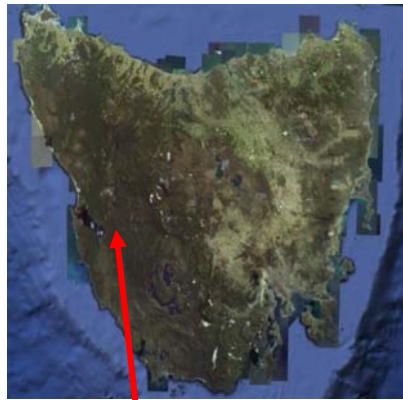
Location in Tasmania

This is an extract of a map tendered in the High Court in Commonwealth v Tasmania (1983) 158 CLR 1 (Tasmanian Dam Case)